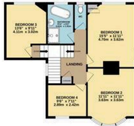
TOTAL FLOOR AREA: 1706 sq.ft. (158.5 sq.m.) approx.

Whilst every attempt has been made to ensure the accuracy of the footprint contained here, measurements of doors, windows, rooms and any other items are approximate and no responsibility is taken for any error, omission or mis-statement. This plan is for illustrative purposes only and should be used as such by any prospective purchaser. The services, systems and appliances shown have not been tested and no guarantee as to their operability or efficiency can be given. Made with Metropia ©2023